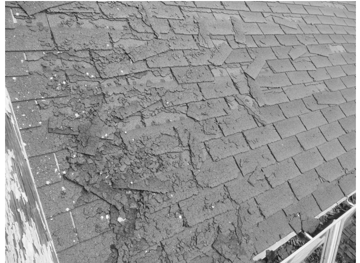
Damage to the roof on the ell of the Bellamy House. This is above the planned local history exhibit space.

We are still seeking donations of books to help make our fundraiser a success. Books in good condition can be dropped off at the Bellamy House between 10:30 and 1:00 on June 15, or arrangements for another time can be made by emailing edwardbellamyassociation@gmail.com . All genres are welcome.